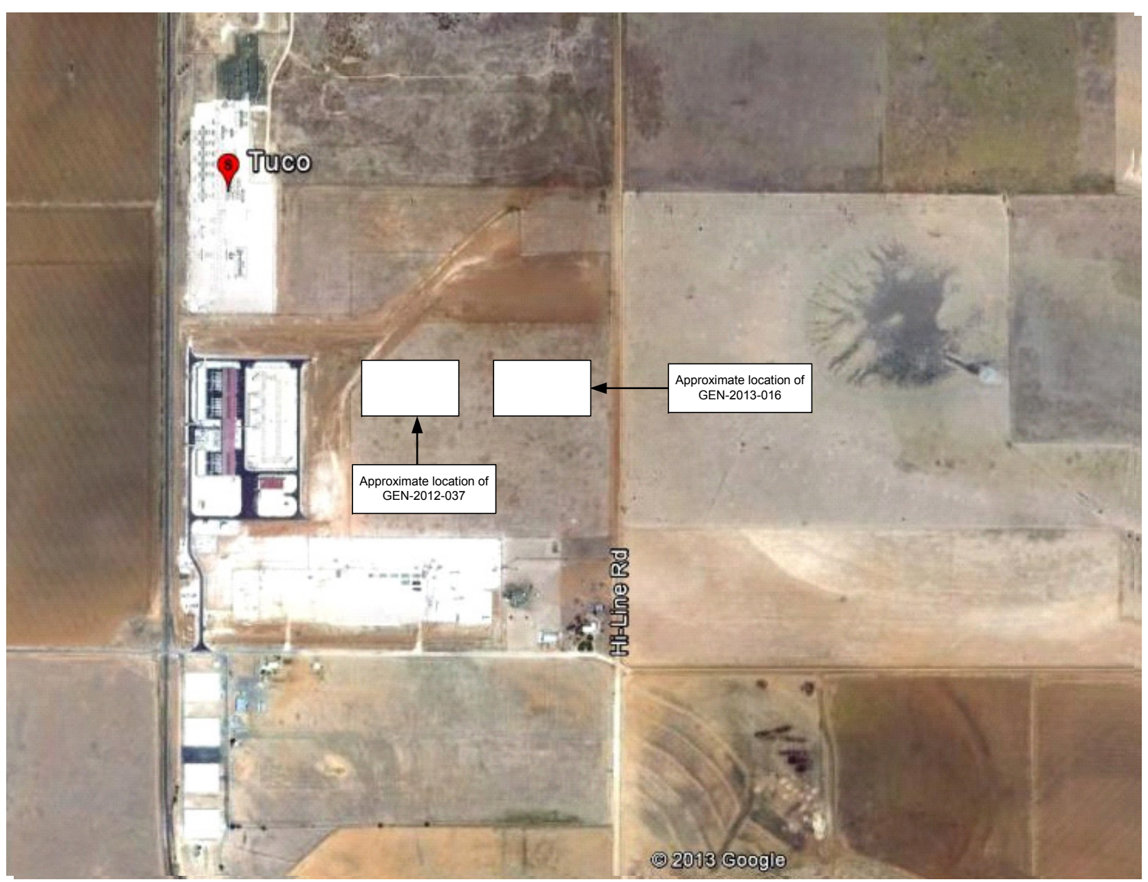
Figure A-1 Approximate location of proposed [Interconnection Customer]'s Combustion Turbine Generator